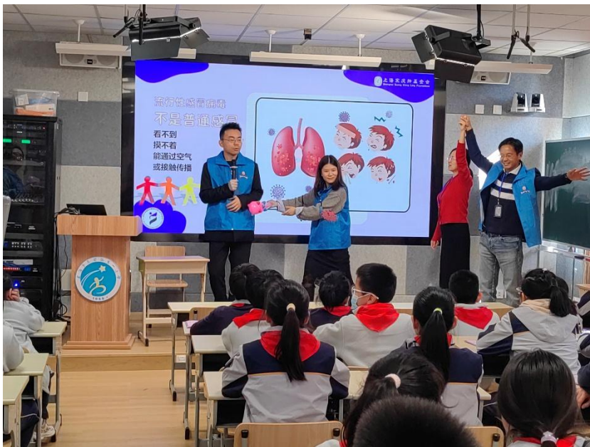
Sanofi volunteers giving a talk to school students in China.

Sanofi China was recognized with 6 National awards for its continuous CSR efforts.