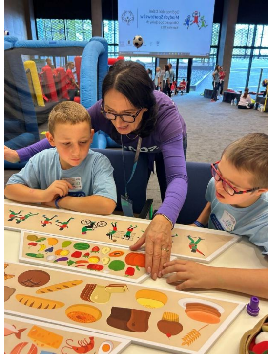
Sanofi volunteer animating Healthy living habits game with 2 children.

The Unified competition between athletes and children of all abilities playing together reminds everyone deserves to belong and to thrive.