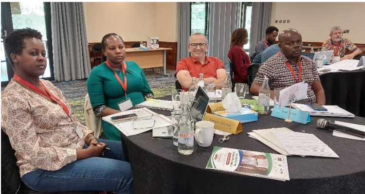
Sanofi's volunteers participating in STEP 2.0 workshops in Kenya and Vietnam.

Together, these engagements demonstrate how targeted skills-based volunteering can accelerate partner impact while fostering leadership development within our own teams.