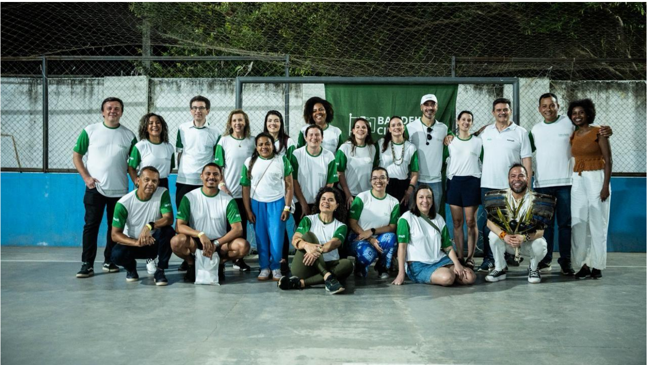
Sanofi volunteers at Bandeira Científica Humanitarian Expedition.

Through this partnership, Sanofi continues to support initiatives that strengthen access to health, foster inclusion and offer transformative volunteer experiences for employees.