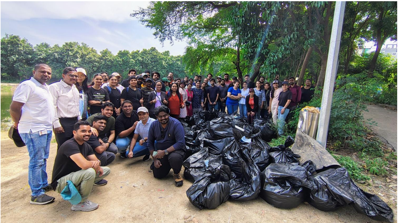
Sanofi volunteers during a Clean-up Day in India

By giving their time and energy, Sanofi volunteers demonstrated how purposeful collaboration can create meaningful impact for communities across India.